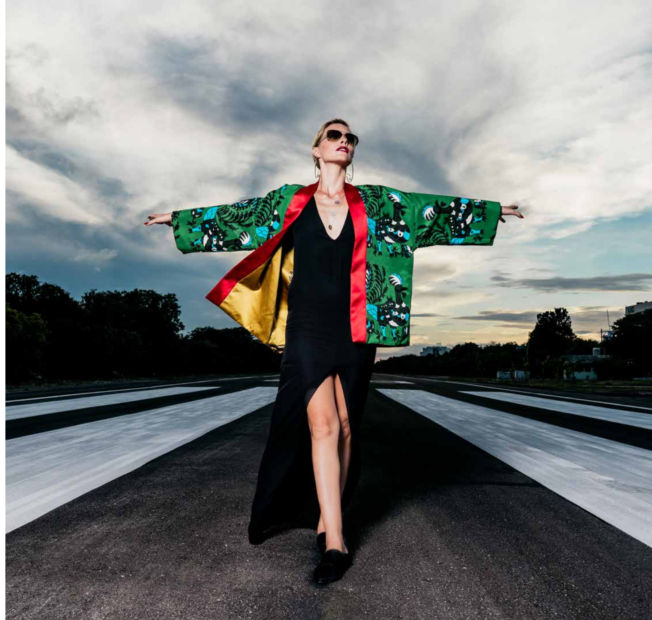
GAFAS LOUISVUITTON | TOTAL LOOK ZAK IK