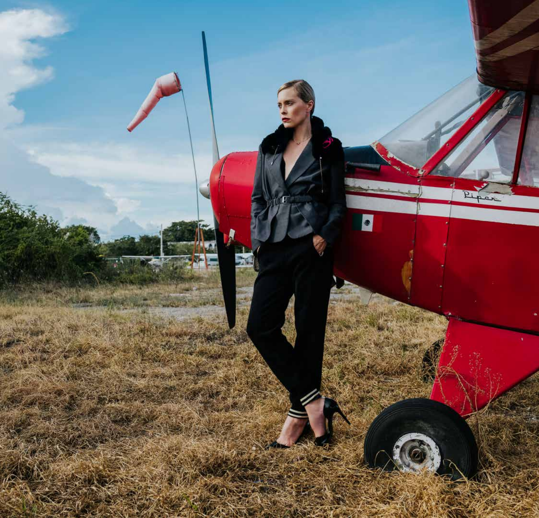
TOTAL LOOK LOUISVUITTON