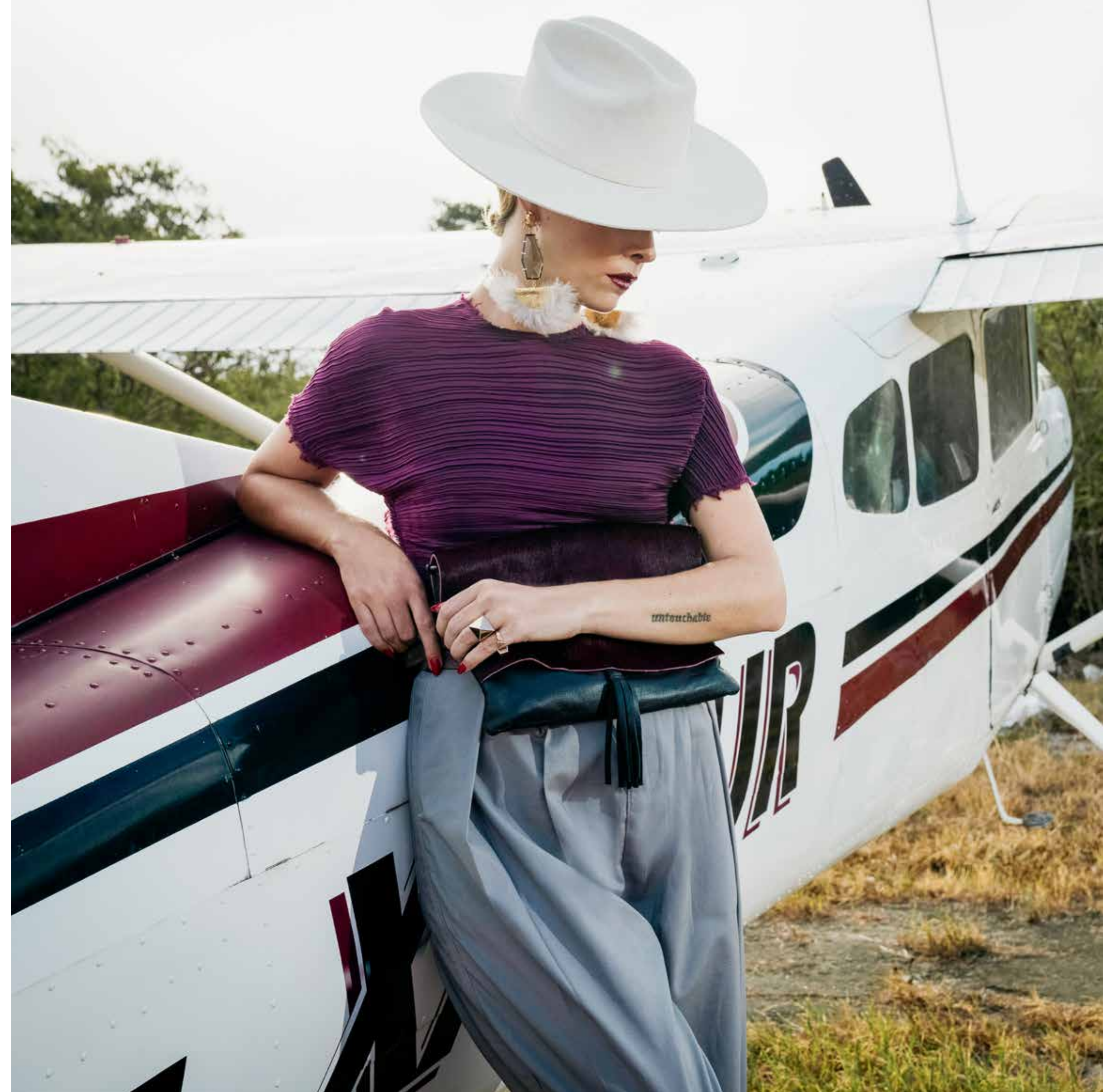
GAFAS PRADA | ARETESY PANTALON ZAK IK | SOMBRERO KUERNO | ANILLOS Y CLUTCH AJNA | BLUSA LANVIN